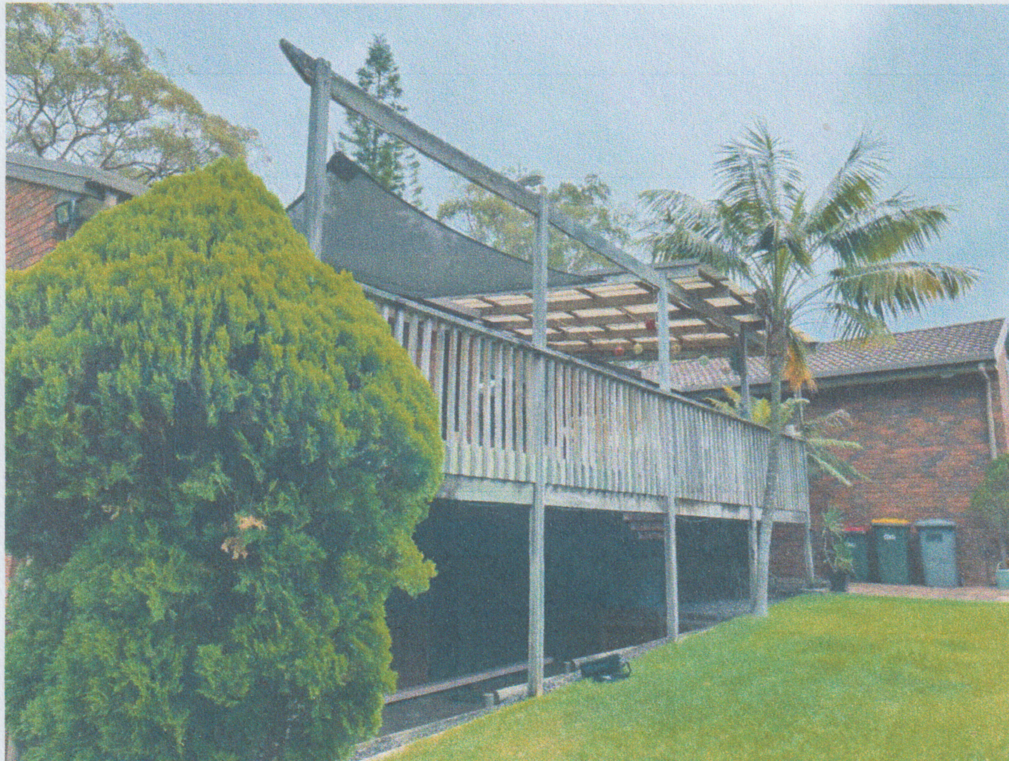
Figure 1 Existing deck.

Matrix Thornton inspected the existing deck located at the above address on 17/01/2024. Refer figure 1. A scope of works report (M24005.01) was issued on 02/02/2024 detailing the required strengthening works. A second inspection was undertaken on 05/03/2024 to view the pier holes for the retaining wall prior to pouring (M24005.02). The final inspection of the completed works was undertaken on 13/11/2024.